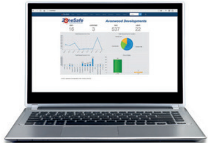
Image above indicates tag battery status and tag detection information.

Image below indicates GPS vehicle location detection.